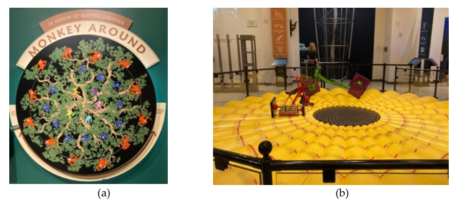
Figure 2. Examples of Materials at MoMath (a) Monkey Around, (b) Square-Wheeled Tricycle

calls them "mathematical science centers." In recent years, the number of such exhibits has been steadily increasing (Beutelspacher, 2018). MoMath found in New York is one of the popular museums that is particularly centered on mathematics and opened in 2012. MoMath has a wide range of collections such as square-wheeled tricycle, coaster roller, hyper hyperboloid, and monkey around (Figure 2). For example, in the exhibit of Hyper Hyperboloid visitors understand straight lines can form a curved surface. Another prominent material is square-wheeled tricycles. With this material, visitors explore how a square-wheeled tricycle rides smoothly and the mathematics behind it (use of a catenary curve) (Rosmarin, 2015). Rosmarin (2015) also reported youths' experiences in museums. The museum enables us to experience visual mathematics rather than numbers and algebra, physical interaction with mathematics, and see diverse images of mathematics, which are not provided in school mathematics and provide new ways of mathematics thinking and learning.