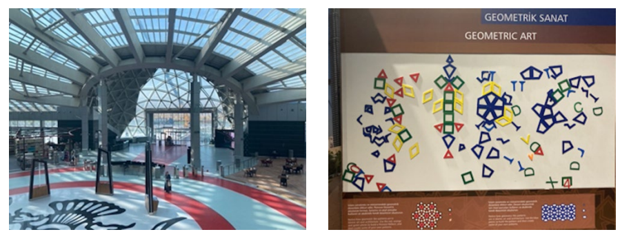
Figure 3 . A Math-themed Exhibit, Islamic Geometric Art from Konya Science Center in Turkey